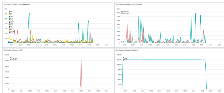
IPv4/6, ICMP, TCP/UDP Analysis

Stamus Network Probes passively monitor network traffic and provide a broad spectrum of traffic metadata. The data types logged by the probes are configured by the user. When all data types are enabled, security alerts account for only 8% of the data by volume.